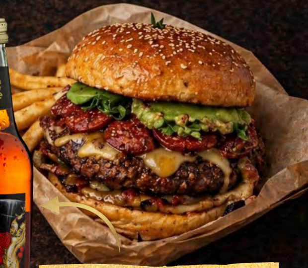
CHORIZO SMASH BURGER